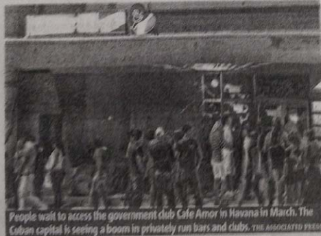
People wait to access the government club Cafe Amor in Havana in March. The Cuban capital is seeing a boom in privately run bars and clubs.